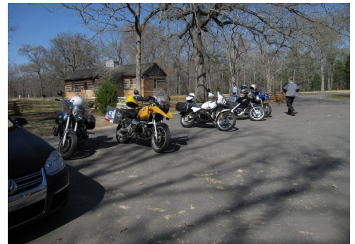
The Motorrads (L to R): R850R, R1150GS, R100GS, G650GS, and R1200GS