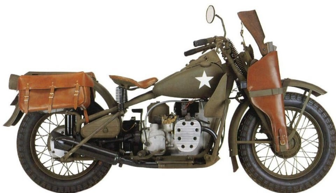
Harley-Davidson XA 1942

that the U.S. Army asked Harley-Davidson to design the next-generation U.S. Military motorcycle. Harley-Davidson created their XA (Experimental Army) model when they took a captured BMW R71 and replicated it part by part, except converted all bolts to SAE measured sizes instead of BMW's metric sized bolts. In addition, per the original U.S. Army request, - the throttle was on the left end of the bars and the hand clutch on the right. A massive rear rack carried a then-lightweight 40-pound radio. And, starting in 1943, the XA also sported the company's first hydraulically damped telescopic forks (a technology that had been introduced by BMW in 1935). Mechanically, the large cooling fins stuck straight out in the breeze, reportedly keeping the XA's oil temperature 100 degrees cooler than a standard Harley WLA. And at 4,600 rpm, the side-valve engine put out a claimed 23 horsepower. The Army ordered a test batch of 1,000 XA's, and at the same time, also asked The Indian Motorcycle Company to make a 750cc shaft-drive twin. Indian came up with a 90-degree V-twin design (much like recent Moto Guzzi) that Indian designated as the Model 841.