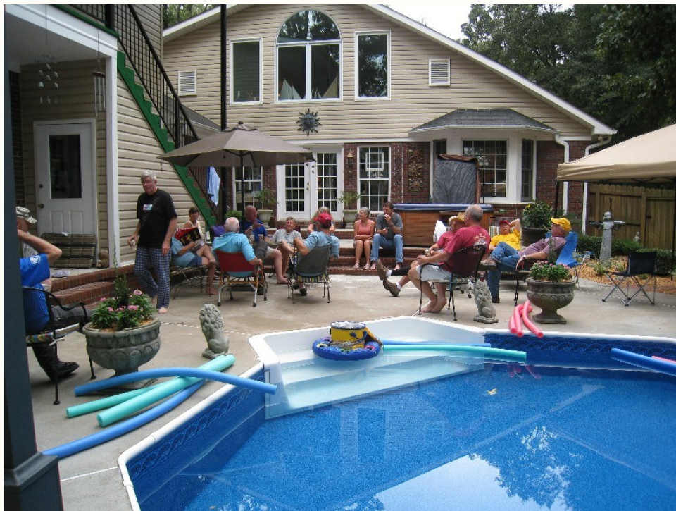
Glass bottles are welcomed in the pool area and running at poolside is encouraged.

Also, there will be a ride out to Fort Rucker at 2:00pm Friday to witness a helicopter fire-power display featuring Jim and Russ Kruse.