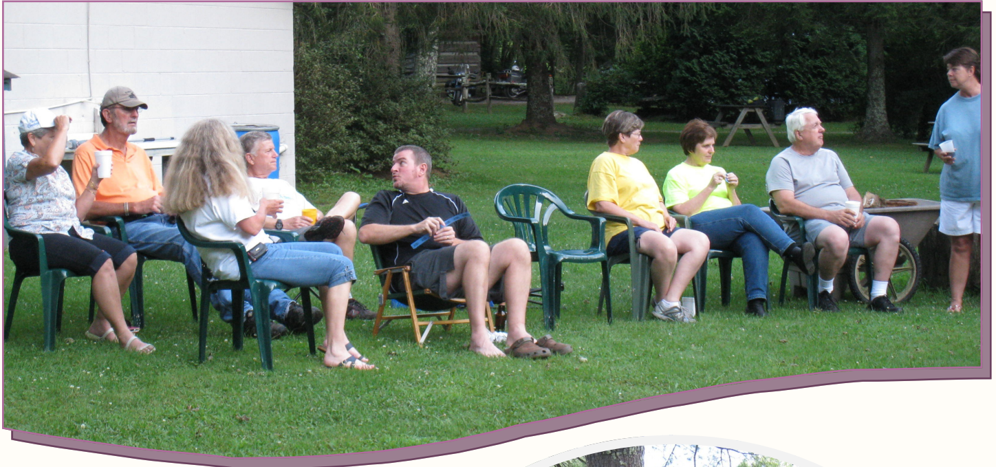
Takin' it easy at Blue Ridge M/C Campground