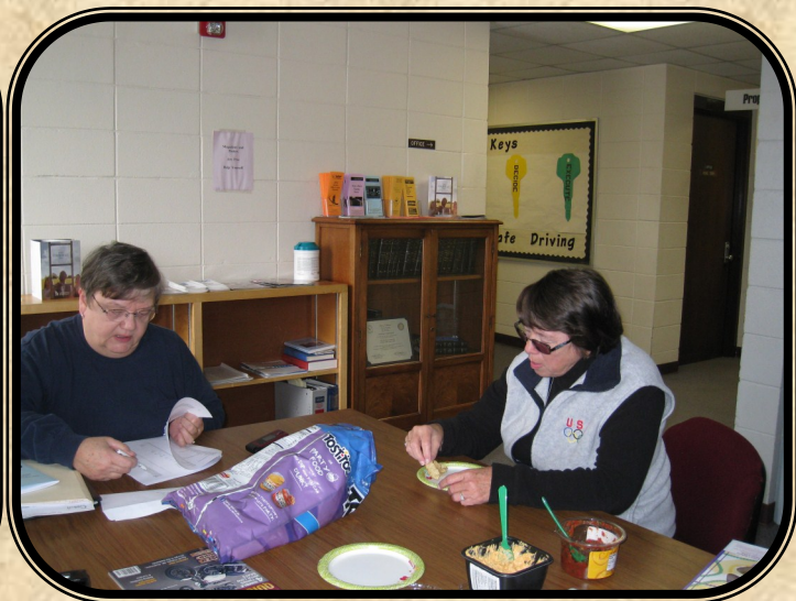
2013 European Riders Rally May 17th - 19th

The Rally dates are set and hope you will mark your calendar to join us this year. We have grown each year with many riders returning and new ones joining us for the first time. Riders from all over the country gather to enjoy some of the best riding in the Southeast through the foothills of KY and TN.