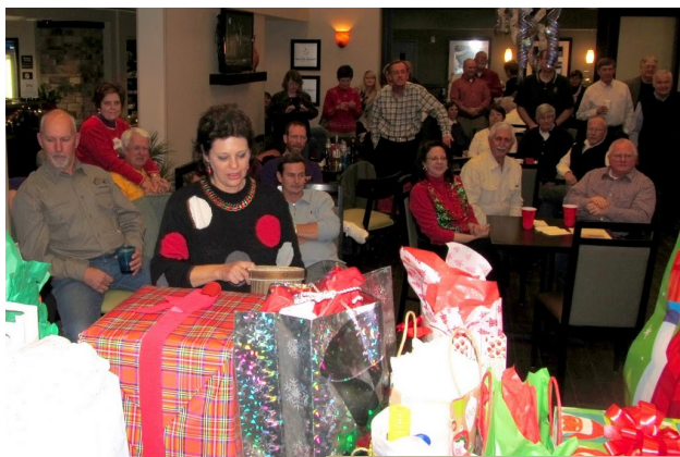
Christmas Party 2011