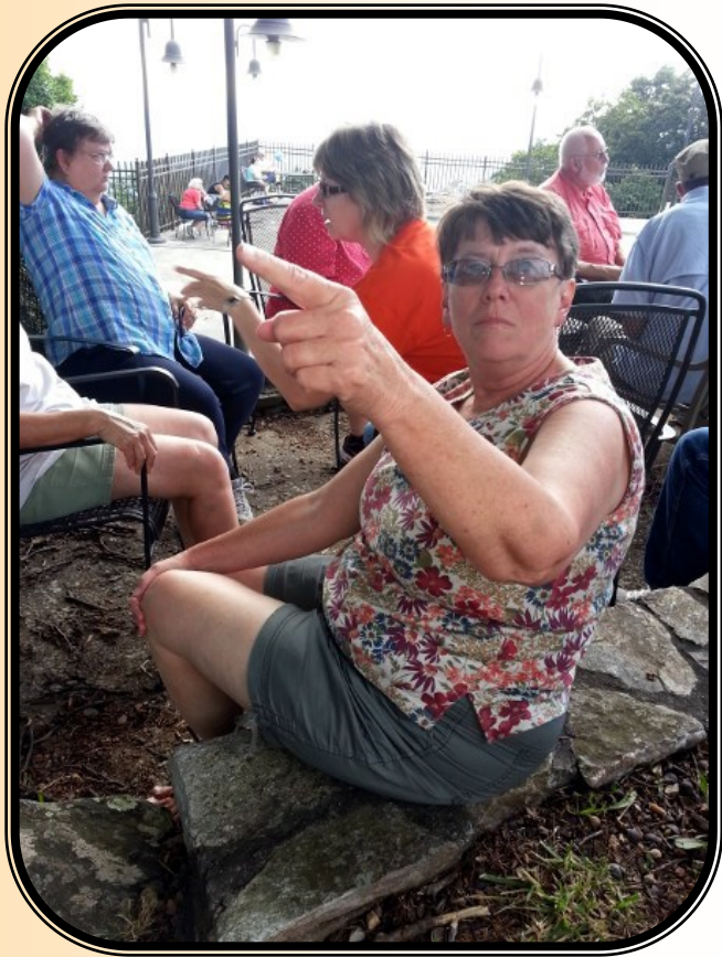
Click that camera one more time and you are going to time out!