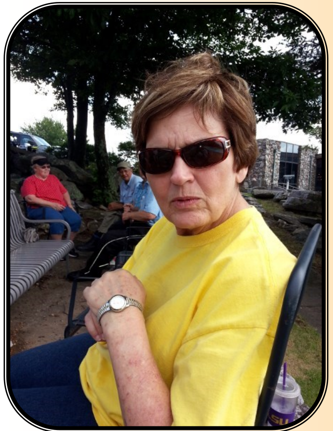
I said "Get that camera out of my face"!