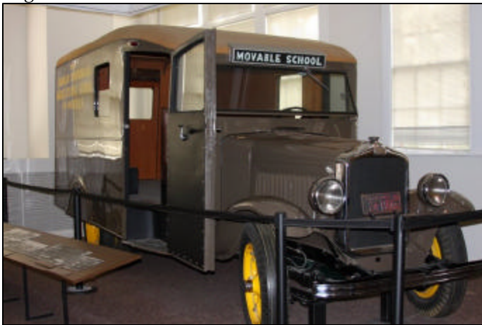
1928 Traveling Agriculture School, Carver Museum, Tuskegee, AL