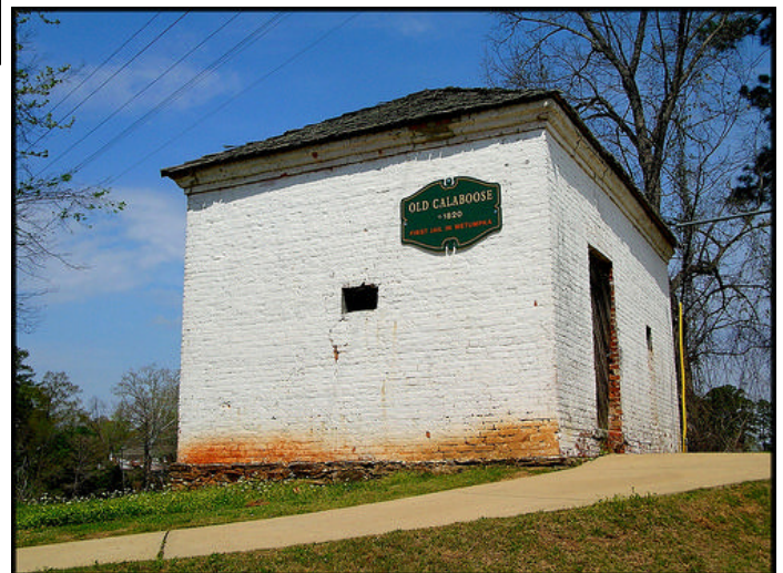
The Old Calaboose, Wetumpka's first jail built in the early 1800s.