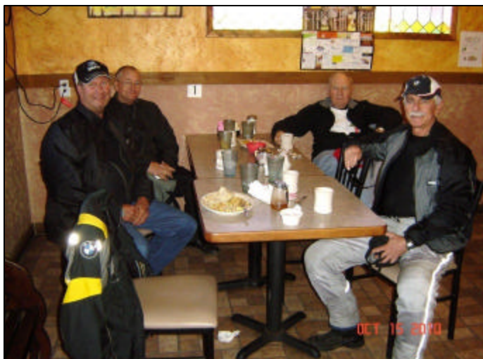
Another Mexican breakfast

Friday 15 th Our group rode into town to the same Mexican restaurant for breakfast. We all had the