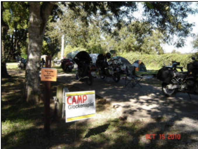
The sign says Camp Glockenspiel, but the breakfast was, you guessed it, Mexican.

Saturday 16 th The club provided breakfast in the campground although belated. The cooks forgot to wake up and food was not served until 7:30A.M.